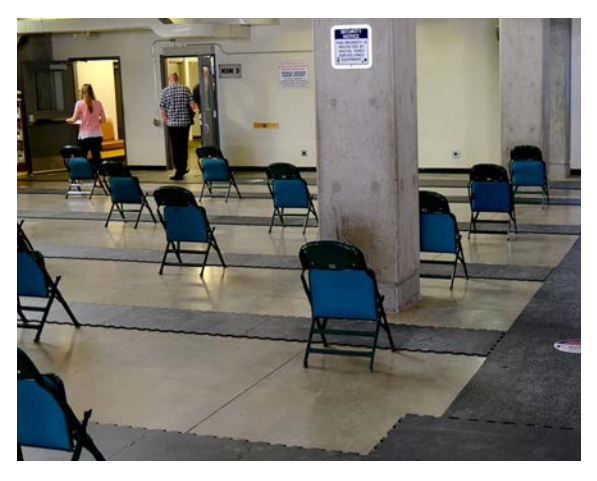
Seats in the Kin Atrium are spaced two metres apart and provide an area where participants can prepare to proceed to the ice.