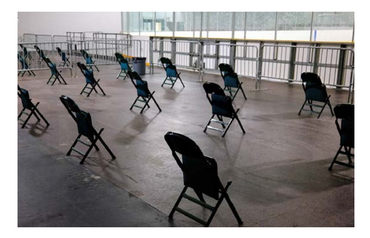
Seats located in Kin 2 are spaced two metres apart and are located north of the ice surface.